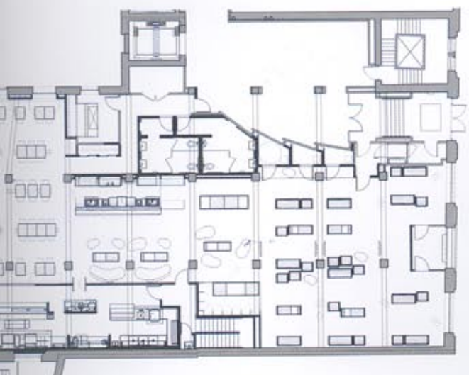
Floor Plan-Retail Open