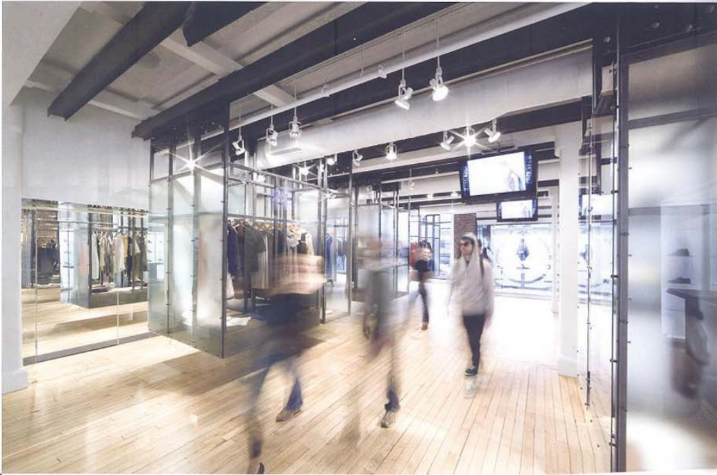
Natural and modern space with timber floor and well arranged glass cases